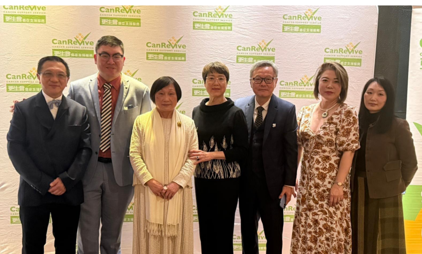
CanRevive 30th Anniversary Charity Dinner