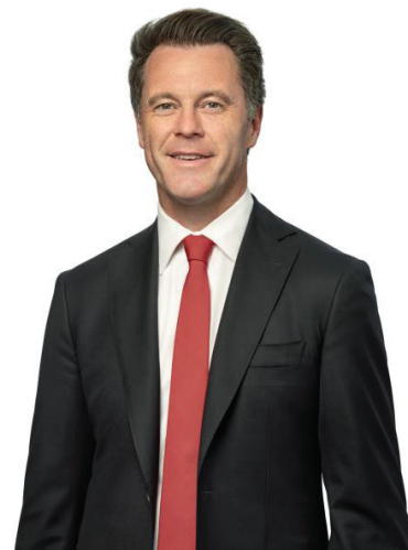
Chris Minns MP Premier

A handwritten signature in black ink that reads "Chris".