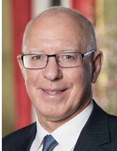
His Excellency General The Hon. David Hurley AC DSC (Ret'd), Governor of NSW