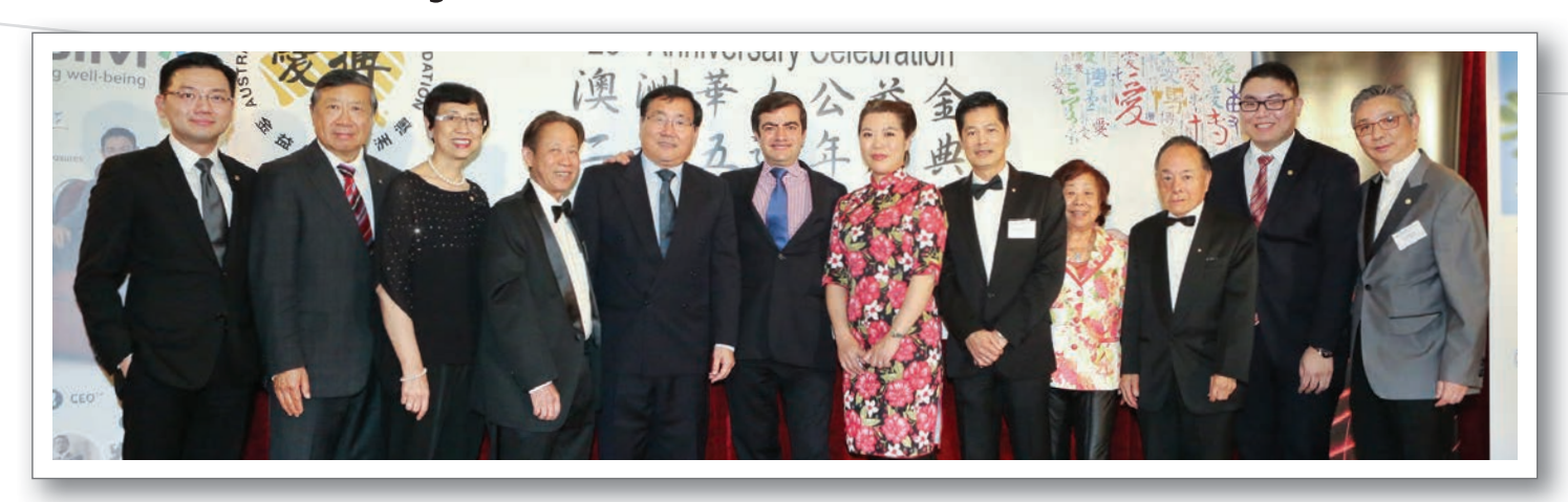
ACCF & NSW Chinese Community New Year Celebration Dinner 2016