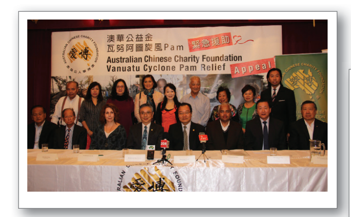
Vanuatu Cyclone Pam Relief