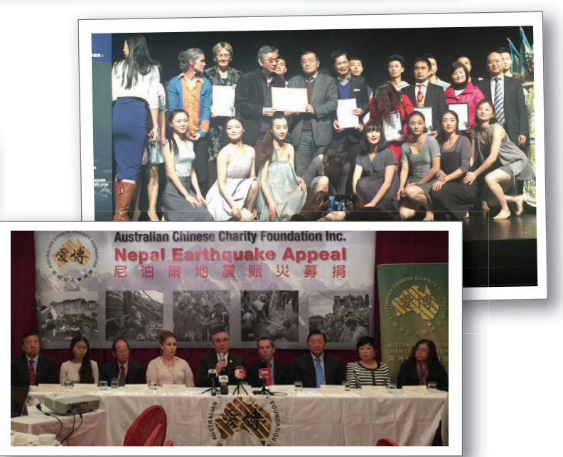
Nepal Earthquake Appeal