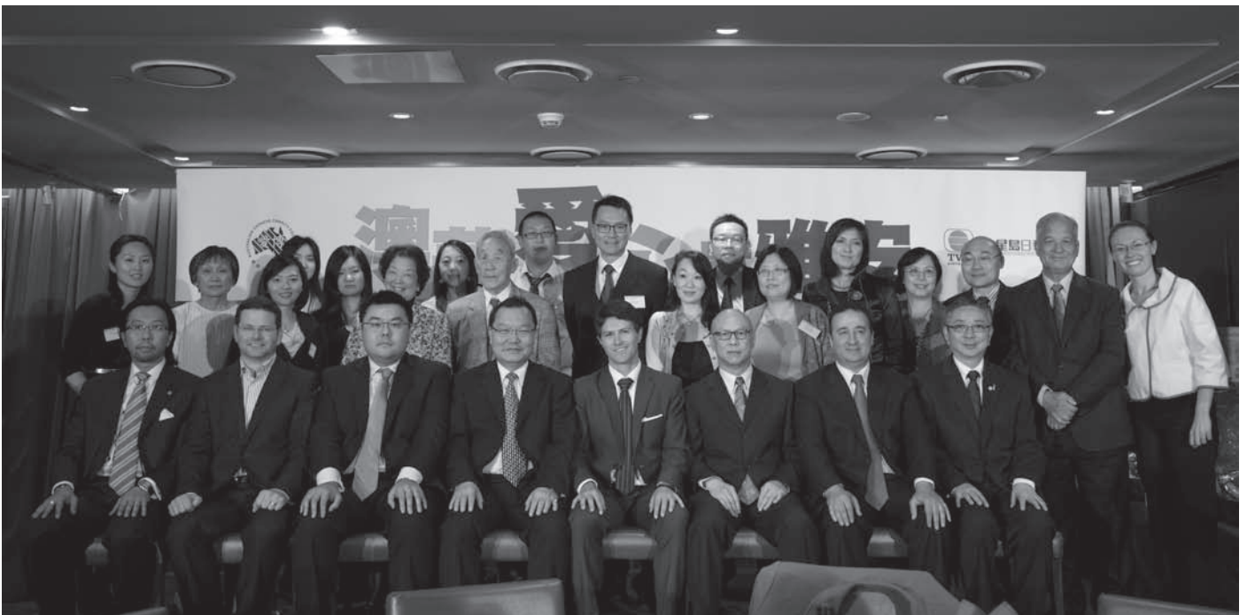
Sichuan Earthquake Appeal 2013