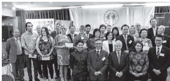
2013 Community Project Funding Recipients