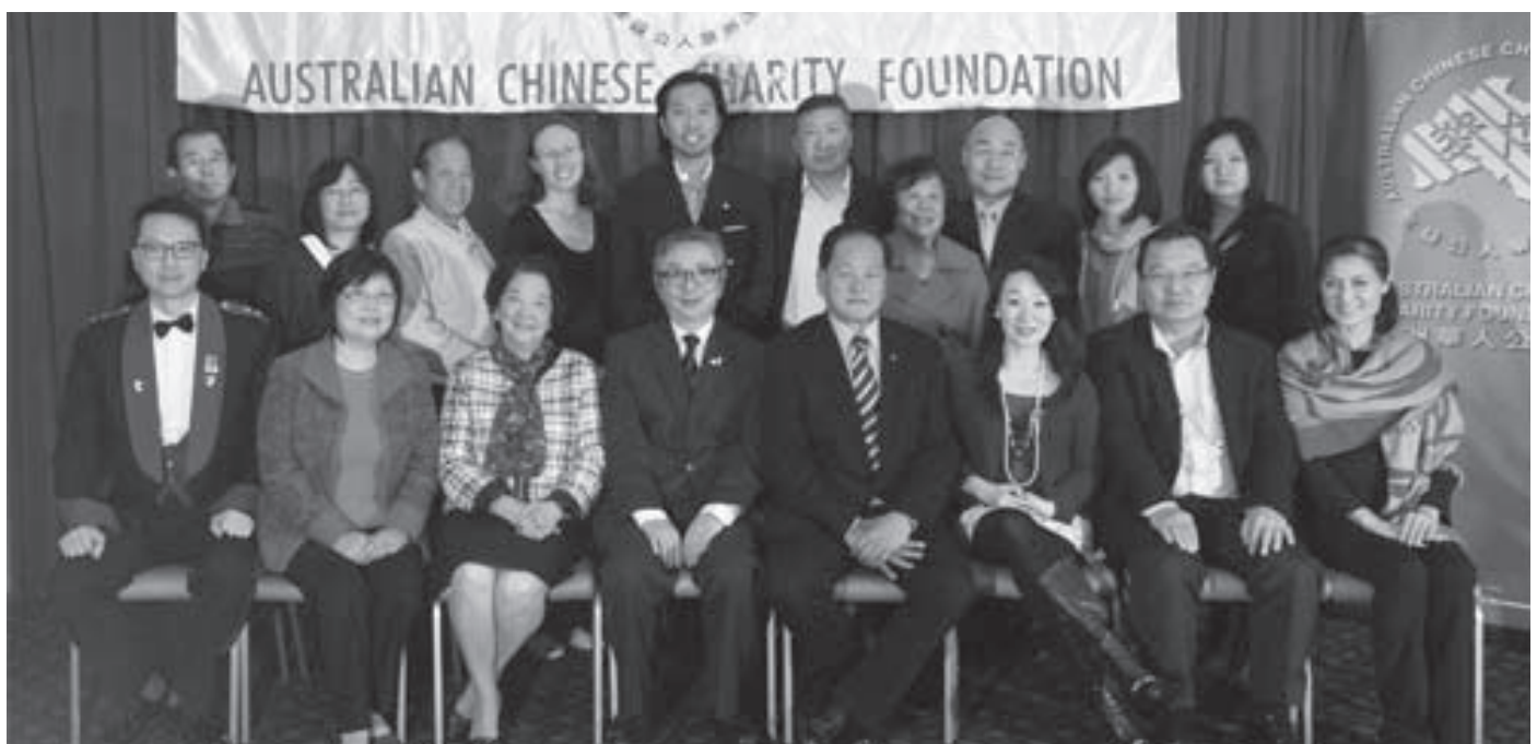
2013-2014 Management Committee