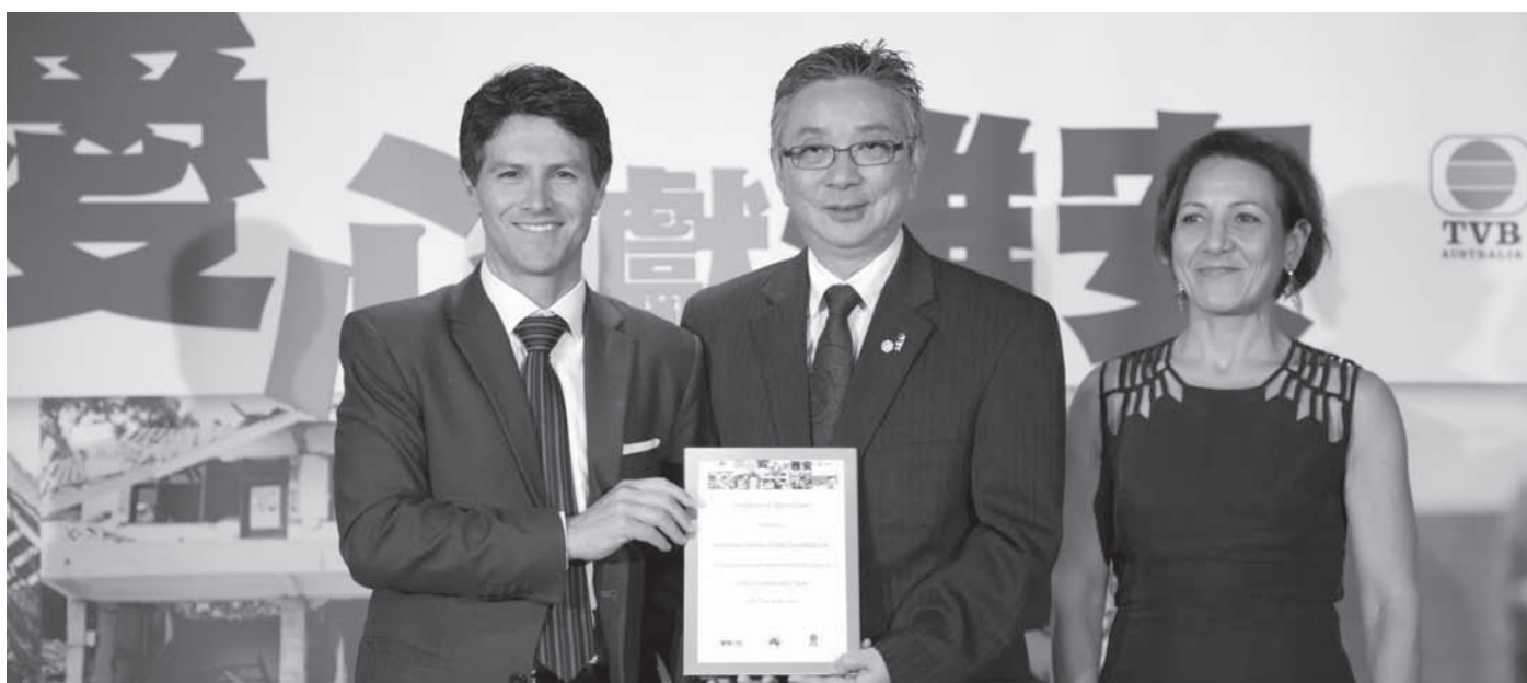
Sichuan Earthquake Appeal 5 May 2013