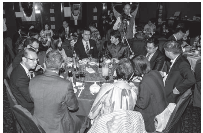
Annual Dinner 19 October 2013