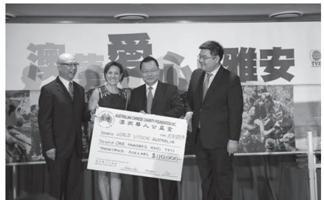
Sichuan Earthquake Appeal

The amount of funding for any application can be up to $1,000. (see the Funds and Grants Assessment Sub-Committee Report 2013-2014).