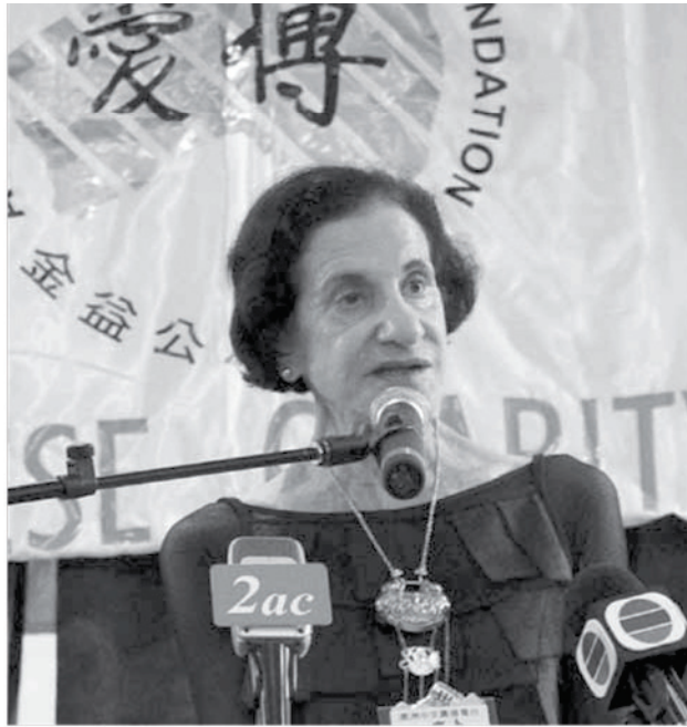
Her Excellency Prof. Marie Bashir AC, CVO Governor of New South Wales Honorary Patron, Australian Chinese Charity Foundation Inc.