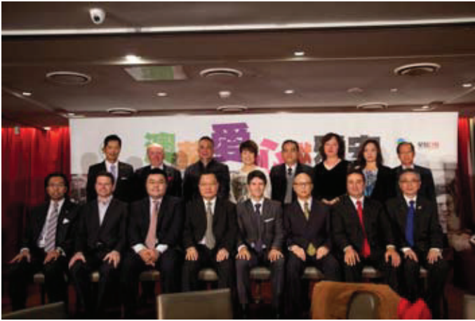
Sichuan Earthquake Appeal 5 May 2013