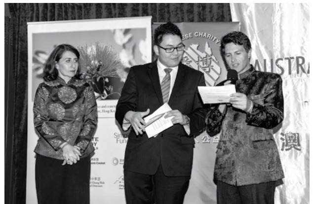
Annual Dinner 2013

在過去的多年，我們的慈善基金大有增加，希望未來更能得以繼續增長。公益金獲得社會各方的大力支持，包括企業贊助機構如澳紐銀行，Ansett Australia，澳洲航空公司，Telstra，西太平洋銀行，匯豐銀行，澳紐私人銀行，及今年新增的贊助機構 InvoCare，NAB Private Wealth和PwC等等，還有多個活動贊助者，社區組織及眾多社會人士。