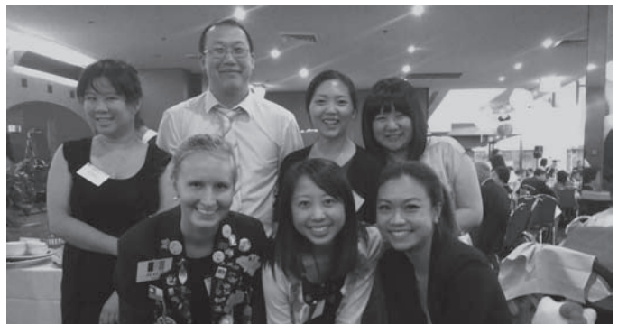
YACCF at ACCF New Year Celebration dinner 1 February 2014