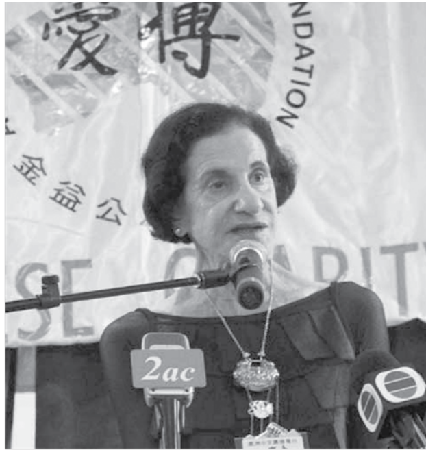
Her Excellency Prof. Marie Bashir AC, CVO Governor of New South Wales Honorary Patron, Australian Chinese Charity Foundation Inc.