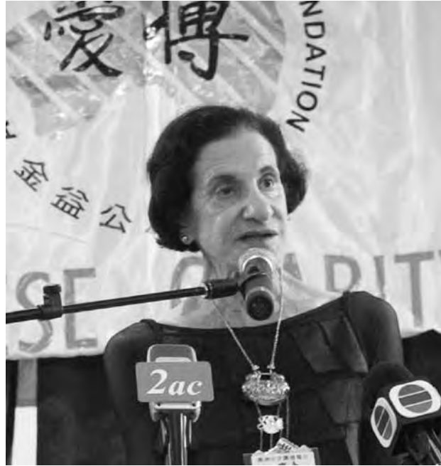
Her Excellency Prof. Marie Bashir AC, CVO Governor of New South Wales Honorary Patron, Australian Chinese Charity Foundation Inc.